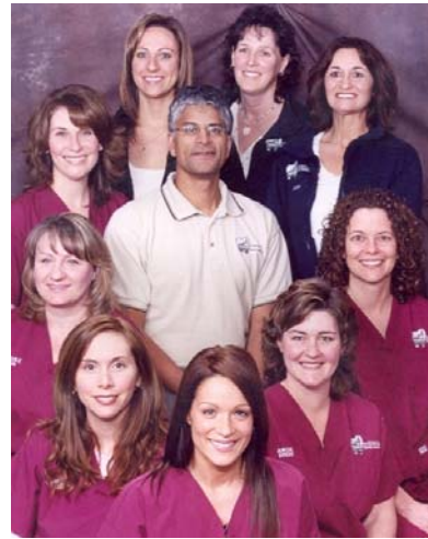
Dr. Guy and Staff

As a patient oriented practice, we are committed to provide quality dental care in a calm, caring environment. We believe in good patient communication and emphasize patient participation in prevention of dental disease, starting with good oral hygiene.