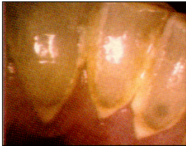
Six months after cleaning, teeth can have plaque build-up as well as stains from food, coffee, tea and tobacco.