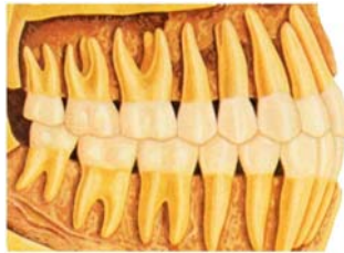
EXTRACTION AND LOSS OF STABILITY

If the tooth can be restored and bone around the tooth sound then it is advisable to save the tooth. To save the tooth a Root Canal would need to be done. After the root canal is completed a crown is required to restore the tooth to full function. This can range in cost between $1000 to $2000. Although an extraction is less expensive, the missing tooth needs to be replaced with a bridge or implant, which can cost more than a root canal or other restorative treatment. Overall, the benefits of natural teeth outnumber the benefits of prosthetic, or replacement, teeth.